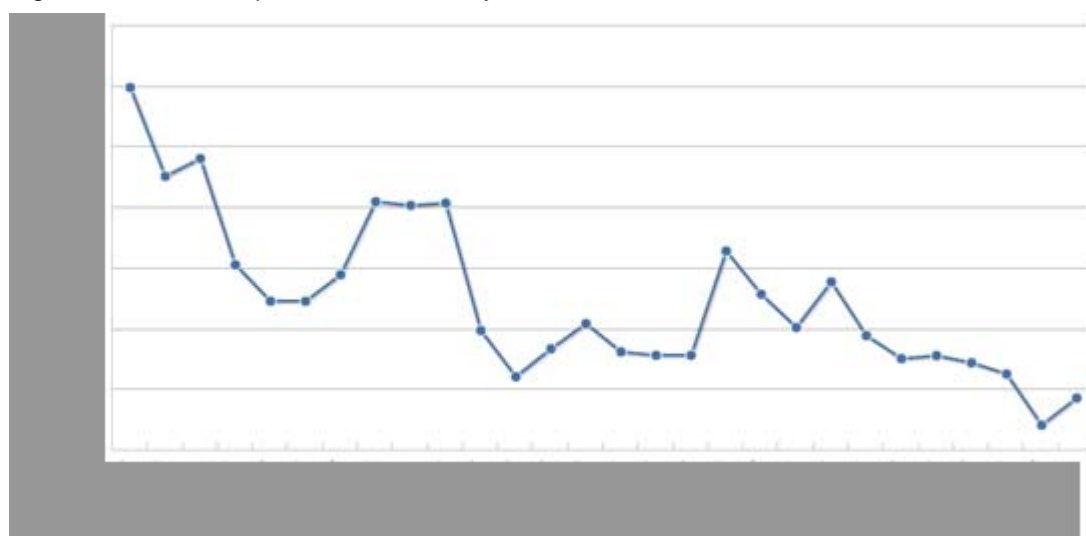
Figure 3-1 Ex-works price of 2, 6-dimethylaniline in China, xxx-xxx